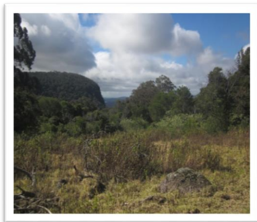
Rankin's Paddock (aka Egg Rock (Kurraragin) Clearing) – Lamington NP